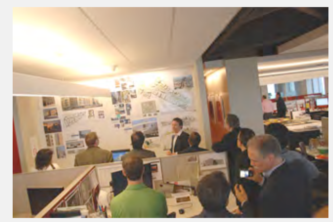
Bus trip to the High Museum and Atlanta office of HOK Architects