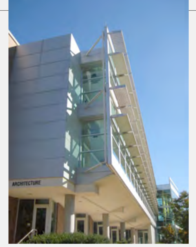
The Architecture Building at Southern Polytechnic State University

The Architecture building, above, was the venue for the conference. Indeed, the students and faculty are deservedly proud of their school and facilities. Many of us went away saying how we wish our school had some of the amenities that we saw at SPSU! (ed.)