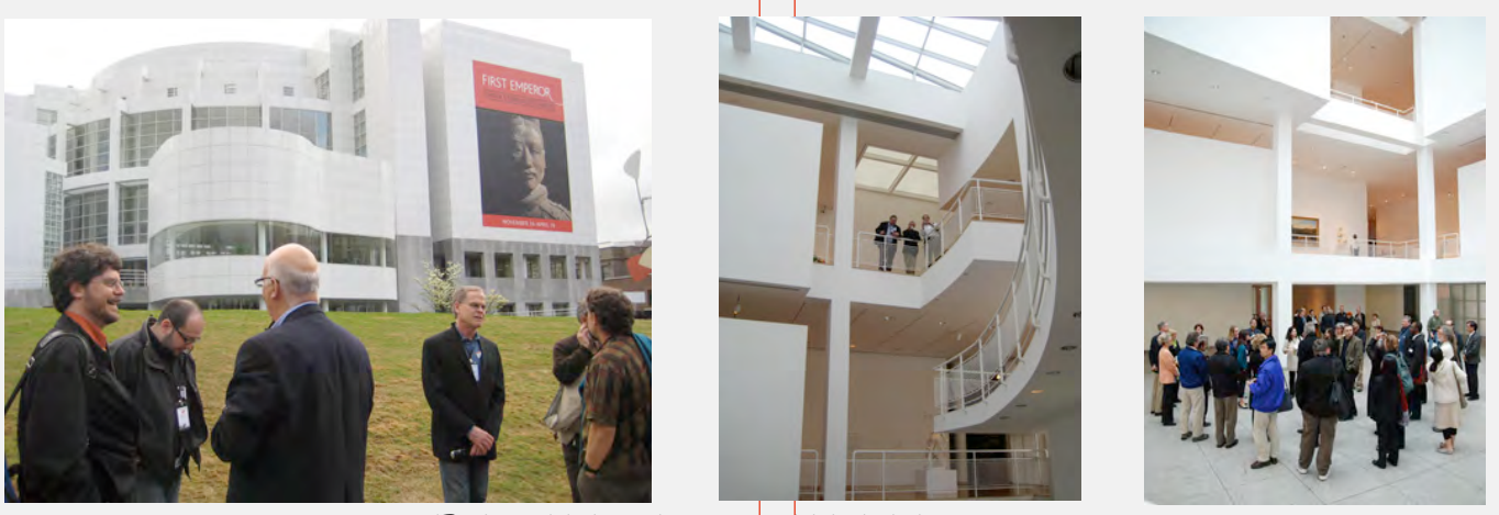
Richard Meier's original High Museum